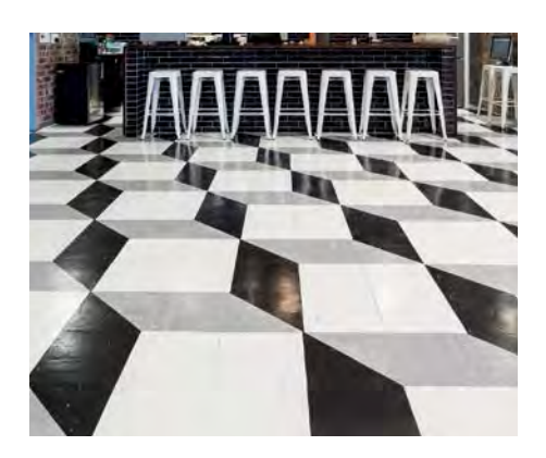
the floor. The designers managed to take a standard hard wearing tile that was not very expensive or exciting, and use it in a creative way that got everybody talking. This project is once again proof that your only limit is your imagination and the enormous versatility of the Polyflor range".