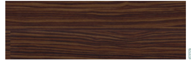
1969 Indian Ebony 101 x 914mm