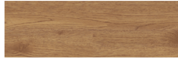
1902 Classic Oak 101 x 914mm