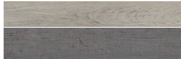
4068 Blue Recycled Wood mixed sizes*