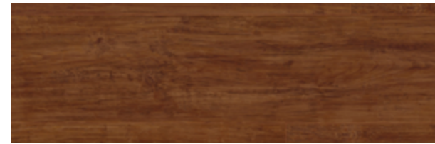
4066 Red Heritage Cherry 184 x 1219mm