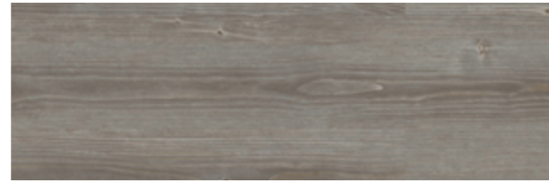
4063 Grey Pine 152 x 1219mm