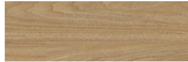
4059 American Oak 152 x 914mm