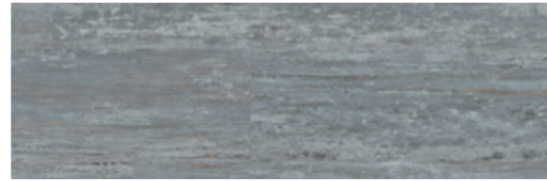
4070 Blue Varnished Wood 152 x 1219mm