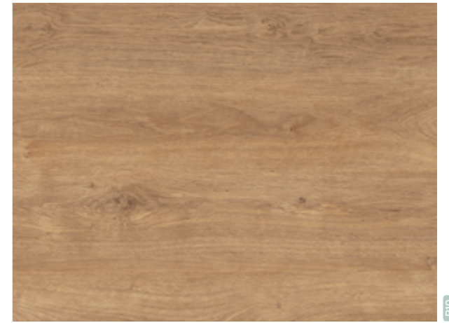
4085 Light Classic Oak 152 x 1219mm