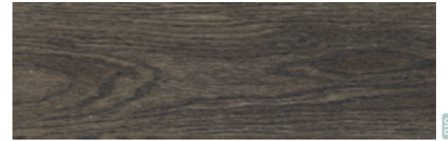
4083 Dark Limed Oak 203 x 1219mm