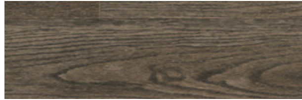
4084 Brown Limed Oak 203 x 1219mm