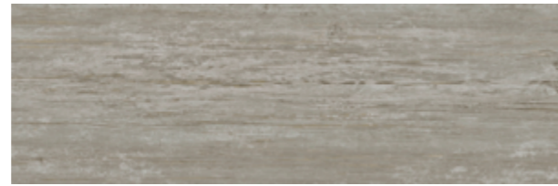
4069 Beige Varnished Wood 152 x 1219mm