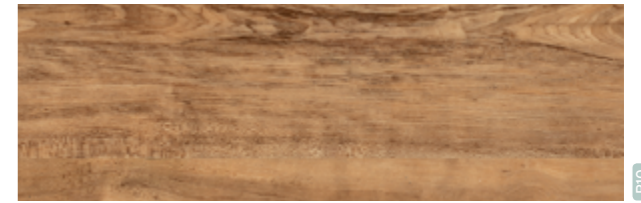
1907 Nut Tree 101 x 914mm