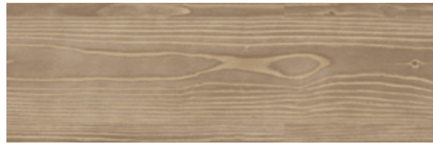
4061 Light Pine 152 x 1219mm