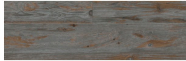
4073 Blue Weathered Spruce 203 x 1219mm