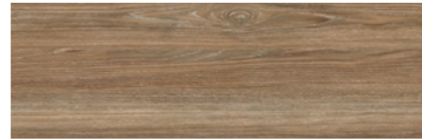
4022 Honey Ash 152 x 1219mm