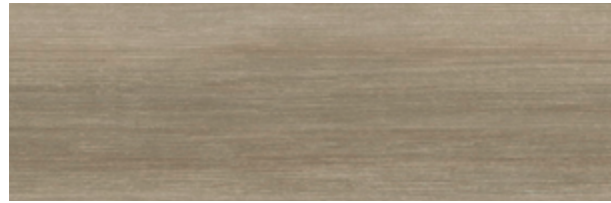
4020 Grey Ash 152 x 1219mm