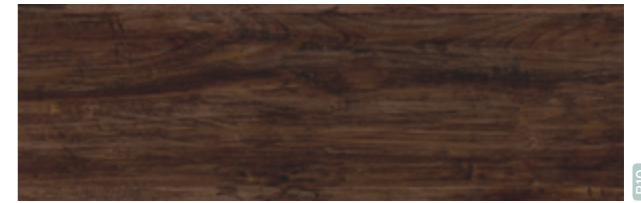
4065 Brown Heritage Cherry 184 x 1219mm