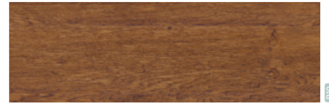
4091 Vintage Timber 101 x 914mm