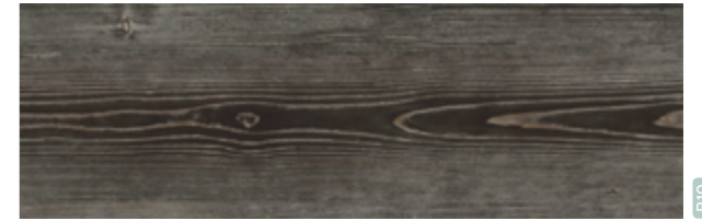
4062 Graphite Pine 152 x 1219mm