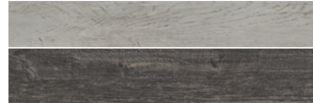
4067 Dark Recycled Wood mixed sizes*