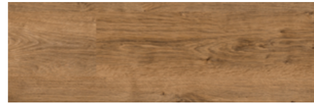
4086 Honey Classic Oak 152 x 1219mm