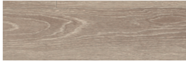
4081 Blond Limed Oak 203 x 1219mm