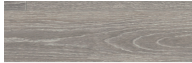
4082 Grey Limed Oak 203 x 1219mm