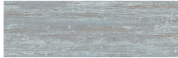
4071 Light Varnished Wood 152 x 1219mm