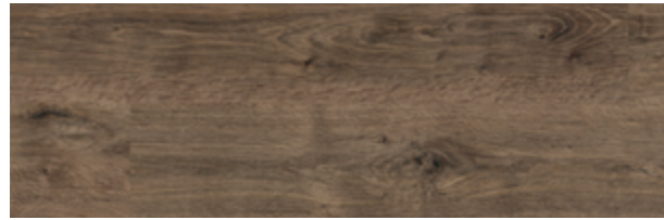
4088 Dark Classic Oak 152 x 1219mm