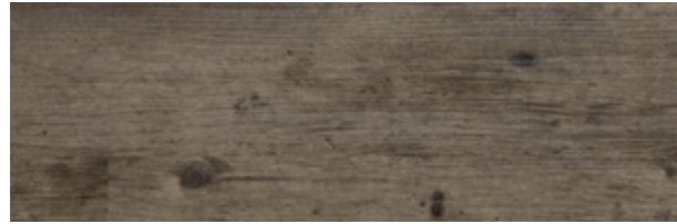
4019 Weathered Country Plank 152 x 914mm