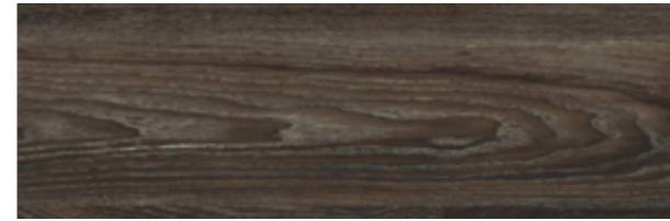
4036 Aged Elm 152 x 914mm