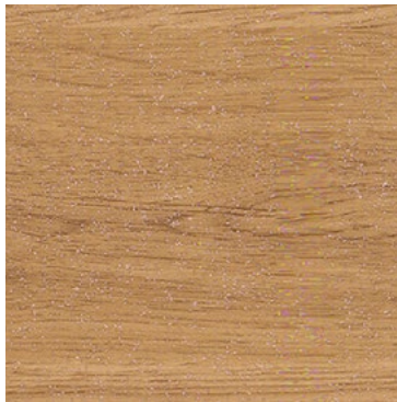
European Oak 3347