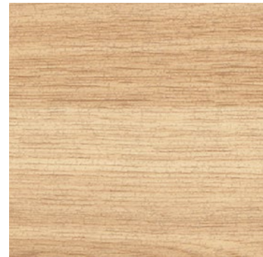
American Oak 3387