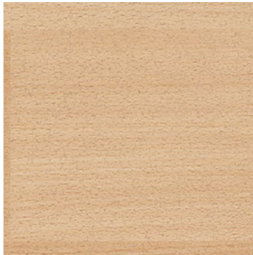
Warm Beech 3297