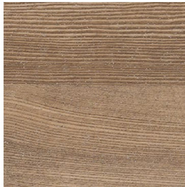
Tropical Pine 3376