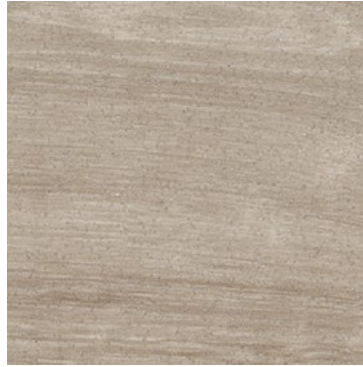
Sun Bleached Oak 3372