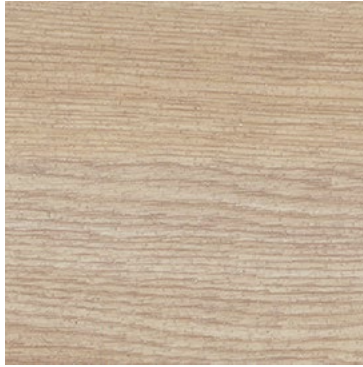
Oiled Oak 3374