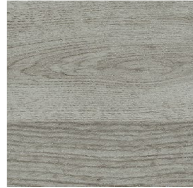
Silver Oak 3357