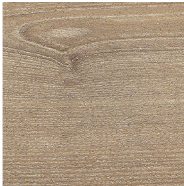
Roasted Limed Ash 3375