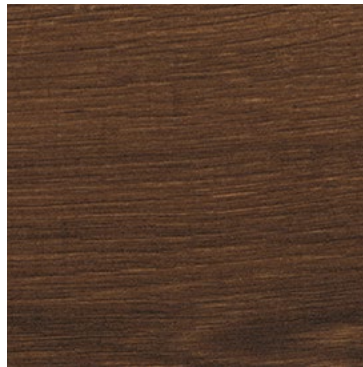
Aged Oak 3373