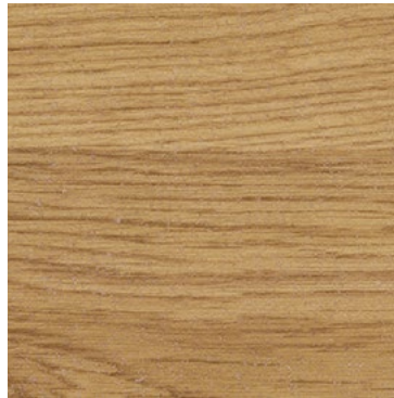
Rustic Oak 3337