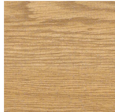
Classic Oak 3107