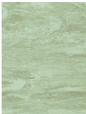
Eau de Nil 9080** w/r 9080