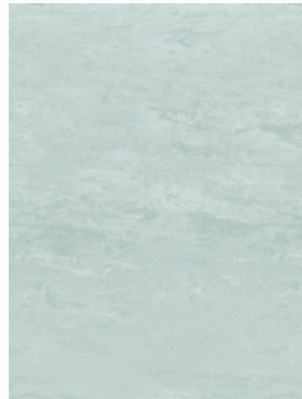
Sea Green 9190 w/r 9190