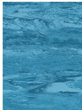
Venetian Blue 9040** w/r 9040