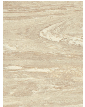
Mushroom 9110** w/r 9110