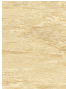
Desert Sand 9180* w/r 9180