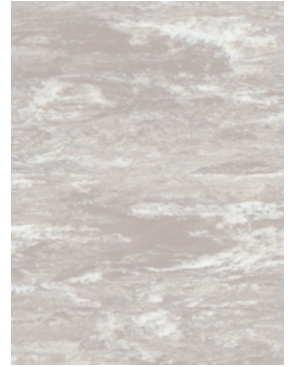
Nougat 9010** w/r 9010