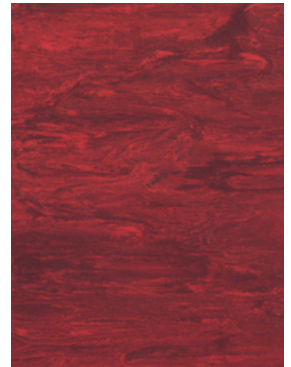
Black Cherry 8580 w/r 8580