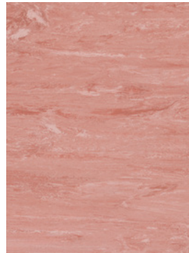
Red Cedar 9300* w/r 9300