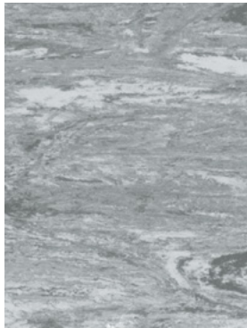
Graphite 9120* w/r 9120