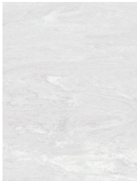
Polar Grey 9340** w/r 9340