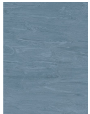
Atlantic Blue 9170 w/r 9170

►Dove White and Black Panther features a traditional marbled decoration - they are not plain in terms of appearance.