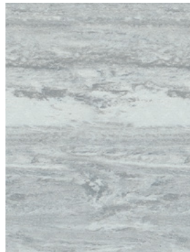
Slate Grey 9200** w/r 9200