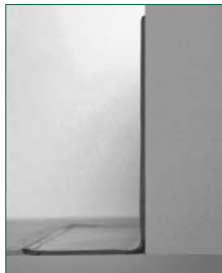
Figure 36 Set-in covered skirting

Where it is impractical or where it is not cost effective to use the site-covered method of installation, the Polyflor Ejecta set-in skirting (Figure 36) is a viable alternative. Very similar to the sit-on type skirting in appearance, the set in skirting has a 50mm toe which is adhered to the subfloor and allows the main field of sheet vinyl to be welded to it.