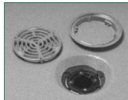
Figure 31 Stainless steel drain prior to fitting vinyl clamping ring

The floor gradient into the drain depends on the process, traffic volume and the surface texture of the floorcovering. The drains used should be built to permit examination, cleaning and repair without these operations causing damage to the floor.