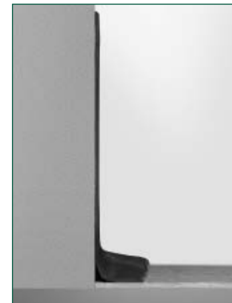
Figure 37 Sit-on covered skirting

Sit-on skirting (Figure 37) generally tend only to be used in conjunction with tiled floors to provide a finish around the perimeter of the room. The sit-on skirting is adhered to the walls and the toe of the skirting sits on top of the floor; it is not welded. If requested suitable mastic sealant can be used beneath the toe of the skirting.