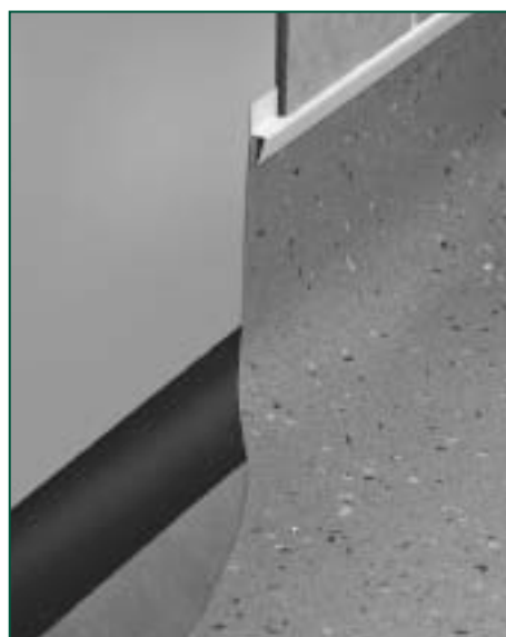
Figure 35 Polyflor Ejecta CT Strip

either site-covered up the wall, or a “set in” covered skirting is used which can be welded to the Polyflor vinyl flooring.