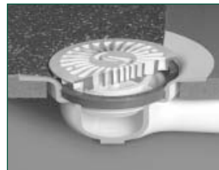
Figure 32 Drain with clamping ring in place