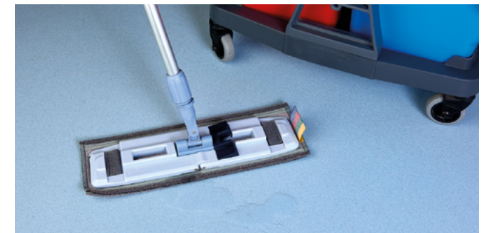
Figure 14.2 Safety mop pad with dual bucket system