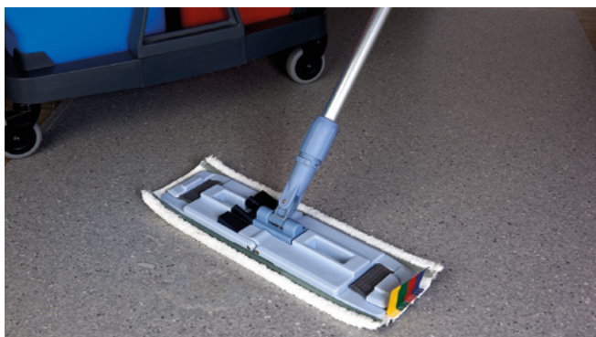
Figure 14.1 Microfibre mop pad with dual bucket system