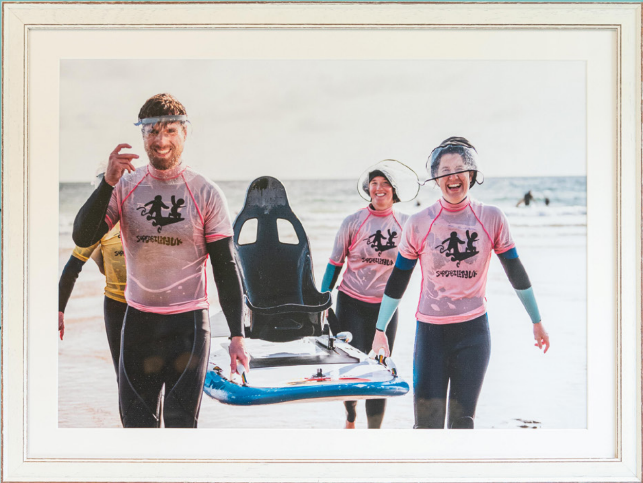
Surfability UK provides surfing lessons and experiences for people with disabilities and learning difficulties