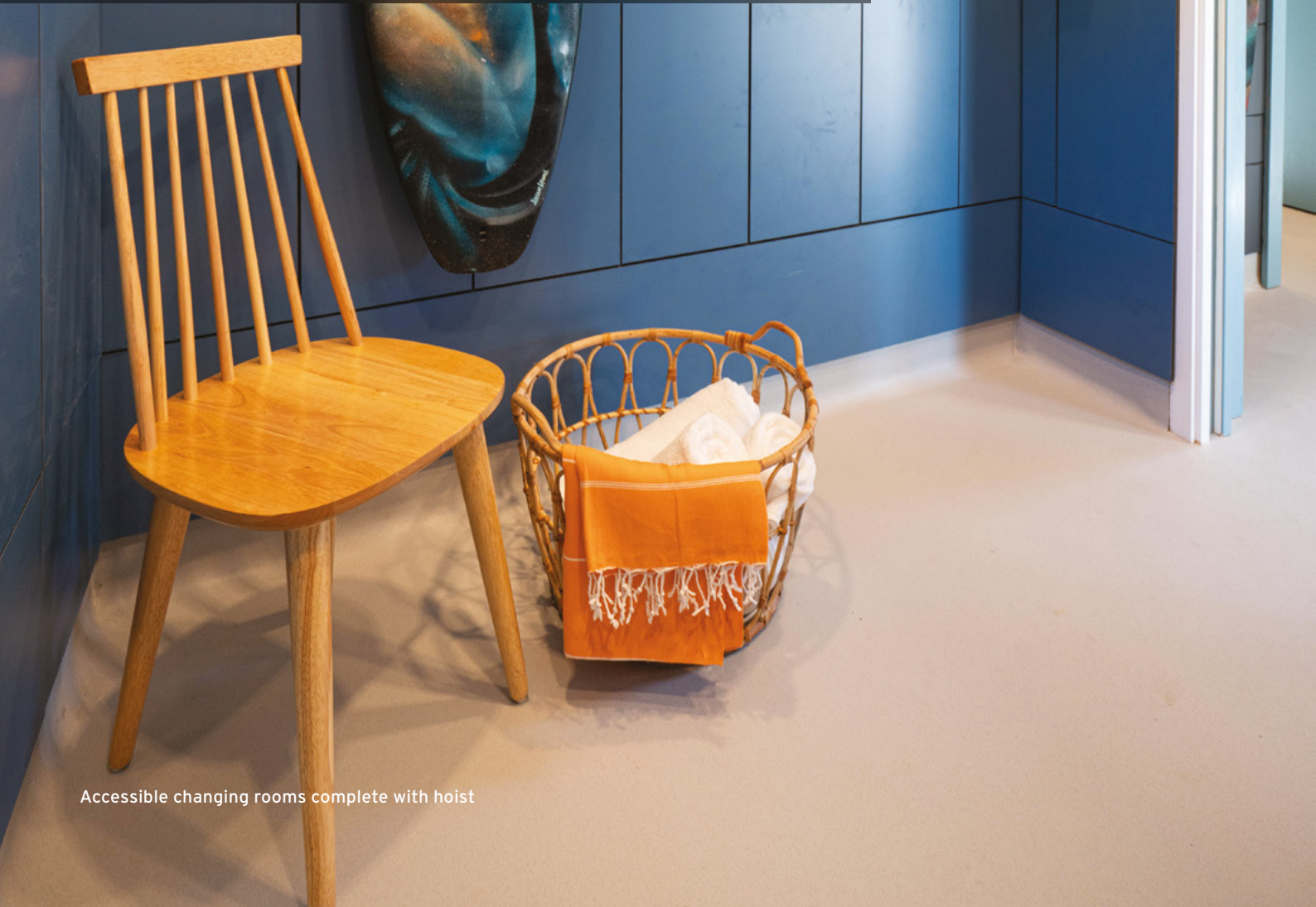
Accessible changing rooms complete with hoist