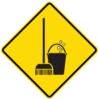
INITIAL CONSTRUCTION CLEAN