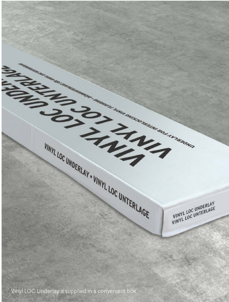
Vinyl LOC Underlay is supplied in a convenient box