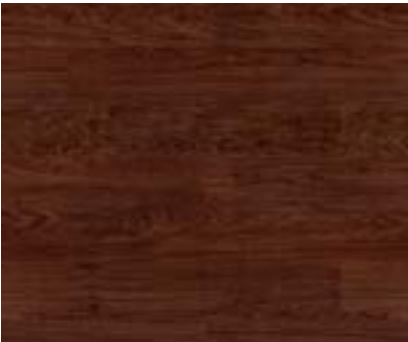
3990 Brazilian Walnut w/r 3990 Plank size: 133 x 1000mm LRV 7.8