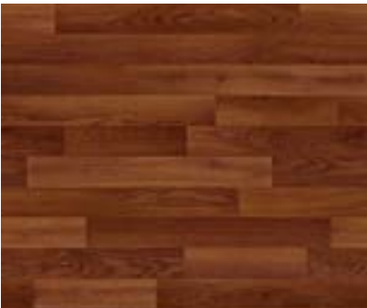
3360 Mahogany w/r 3360 Plank size: 84 x 332/664mm LRV 10.1