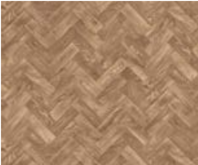
3108 Eton Oak Parquet w/r 9822 Plank size: 76.2 x 288.6mm LRV 23.6