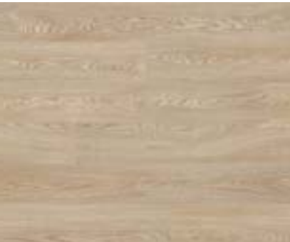
2990 Oiled Oak Plank size: 167 x 1500mm w/r 2990 LRV 35.0