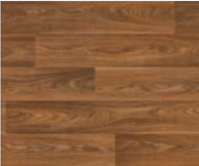
3120 French Walnut w/r 3120 Plank size: 167 x 1000mm LRV 17.0