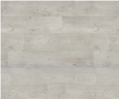
3113 Blanched Oak Plank size: 200 x 1000mm w/r 3113 LRV 41.7