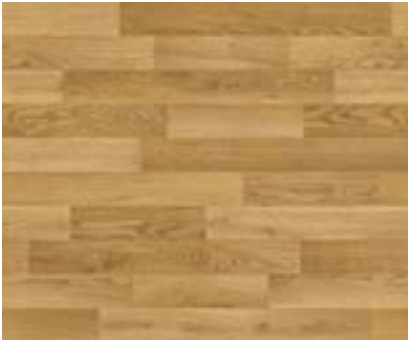
3330 Rustic Oak w/r 3330 Plank size: 84 x 332/664mm LRV 29.2