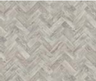
3106 Parish Oak Parquet Plank size: 76.2 x 288.6mm w/r 9841 LRV 31.7

Forest fx represents the natural beauty and sophistication of wood in a practical and durable vinyl sheet format. This contemporary and wide-ranging palette is further enhanced by a variety of plank sizes, each carefully designed for natural authenticity.