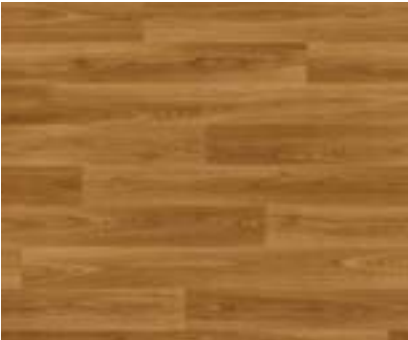
3340 European Oak w/r 3340 Plank size: 100 x 1000mm LRV 21.0