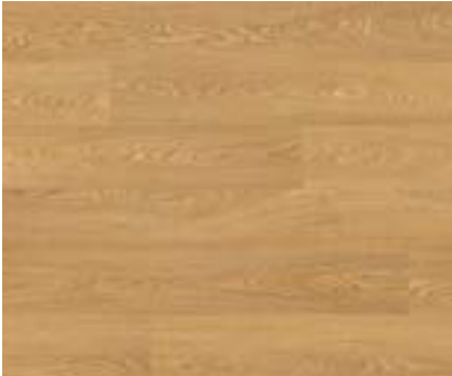
3100 Classic Oak w/r 3330 Plank size: 167 x 1500mm LRV 28.6