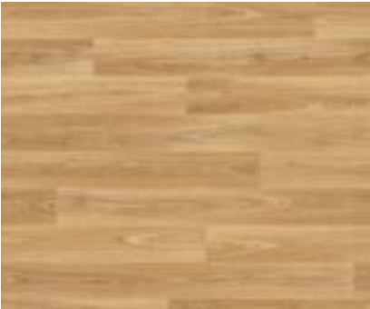
3380 American Oak w/r 3380 Plank size: 100 x 1000mm LRV 35.7