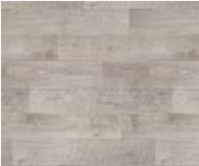
3101 Grey Sawmill Oak Plank size: 180 x 1000mm w/r 3101 LRV 39.9