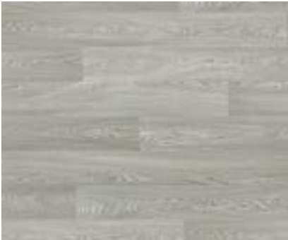
3104 Oslo Oak Plank size: 167 x 1500mm w/r 9829 LRV 31.9