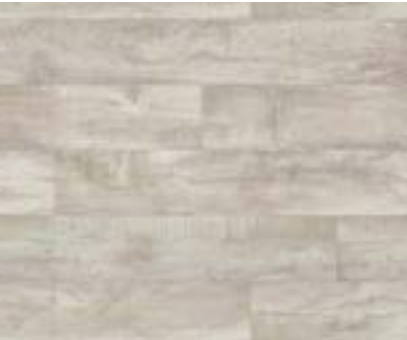
3103 Rock Salt Oak Plank size: 220 x 1500mm w/r 3103 LRV 37.0