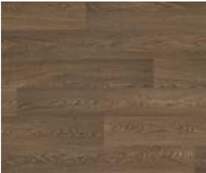
3150 Smoked Oak w/r 3150 Plank size: 167 x 1500mm LRV 14.0