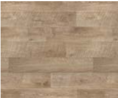
3102 Rural Deckwood Plank size: 180 x 1000mm w/r 3102 LRV 27.6