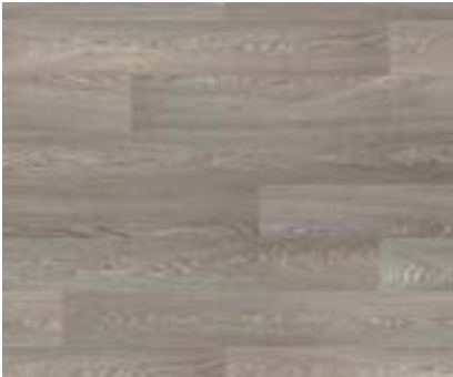
3105 Alloyed Timber Plank size: 167 x 1500mm w/r 9841 LRV 24.3