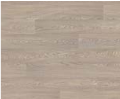
3109 Newport Oak Plank size: 167 x 1500mm w/r 9838 LRV 29.9