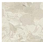
Classic Mystique PUR Silver Mist 1430