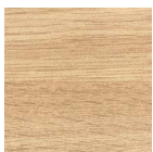
Polysafe Wood fx PUR American Oak 3387