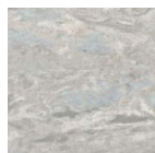
2000 PUR Lace Blue 8500