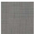
Expona Commercial PUR Light Grey Matrix 5074