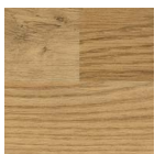
Forest fx PUR Rustic Oak 3330