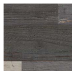
Expona Commercial PUR Blue Recycled Wood 4068