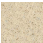
Polysafe Stone fx PUR Gypsum 4044