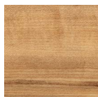
Camaro PUR Nut Tree 2202