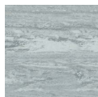
Standard XL Slate Grey 9200