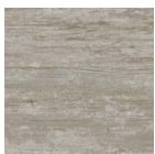
Expona Commercial PUR Beige Varnished Wood 4069