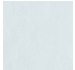
Blue Shingle 4097 w/r 4097 NCS S 1005-R90B LRV 71