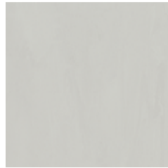
Grey Steel 4095 w/r 4095 NCS S 2500-N LRV 56