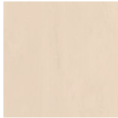
Biscuit Beige 4092 w/r 4092 NCS S 1505-Y40R LRV 62