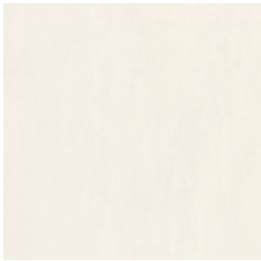
White Chalk 4093 w/r 4093 NCS S 0603-G80Y LRV 80