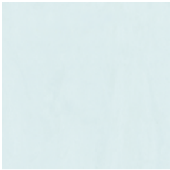
Dusted Blue 4096 w/r 4096 NCS S 0907-B20G LRV 72