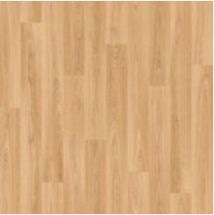
American Oak 3385 plank size in sheet: 100 x 1000mm w/r 3380 LRV 33