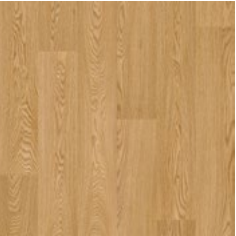
Classic Oak 3125 plank size in sheet: 167 x 1500mm w/r 3330 LRV 30