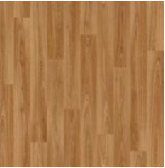
European Oak 3345 plank size in sheet: 100 x 1000mm w/r 3340 LRV 20