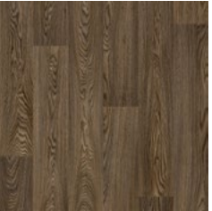
Smoked Oak 3155 plank size in sheet: 167 x 1500mm w/r 3150 LRV 14