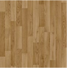
Rustic Oak 3335 plank size in sheet: 84 x 332/664mm w/r 3330 LRV 25