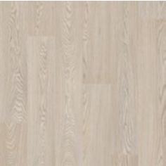
Oiled Oak 3095 plank size in sheet: 167 x 1500mm w/r 2990 LRV 35