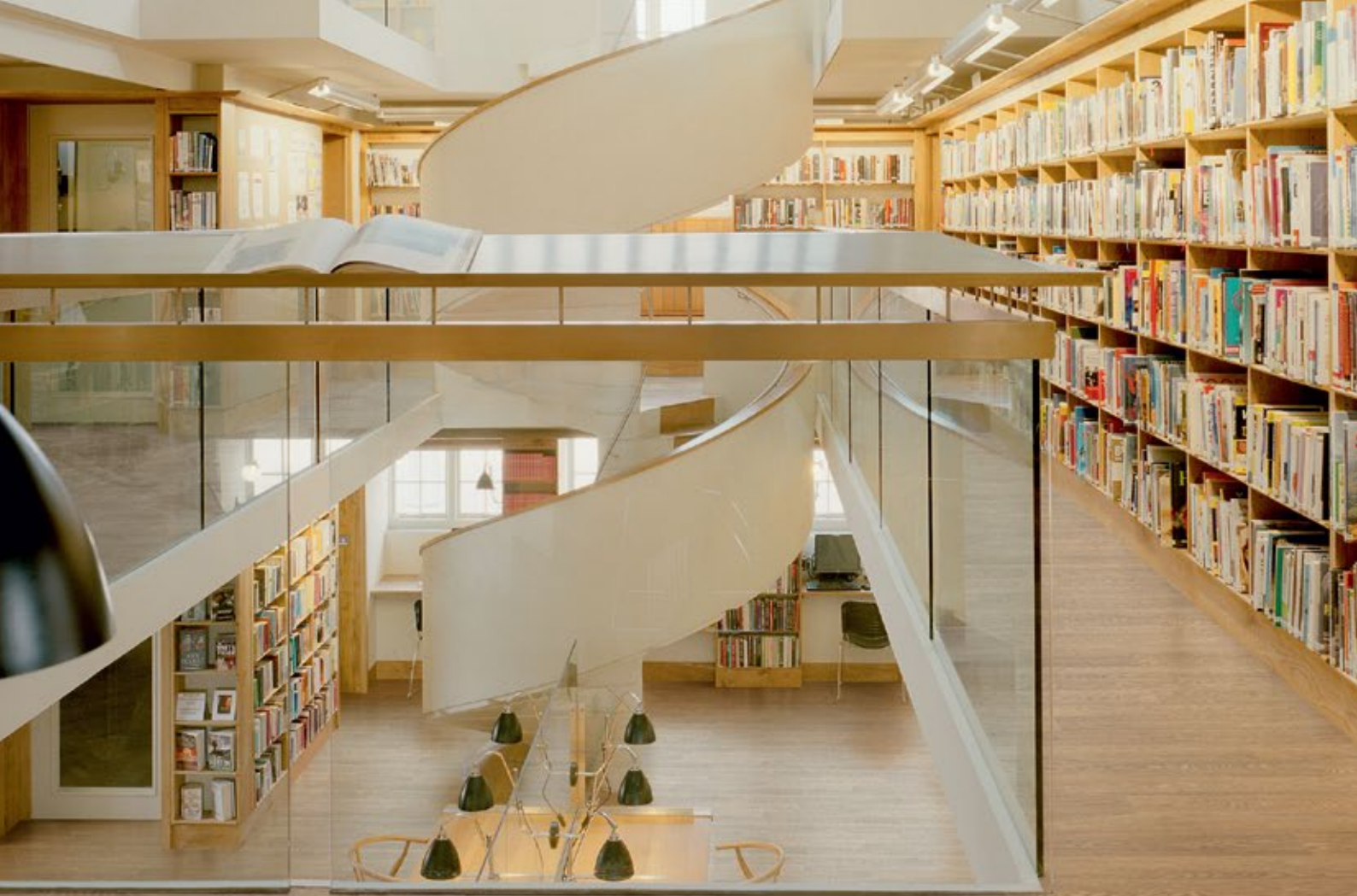
Classic Oak 3125