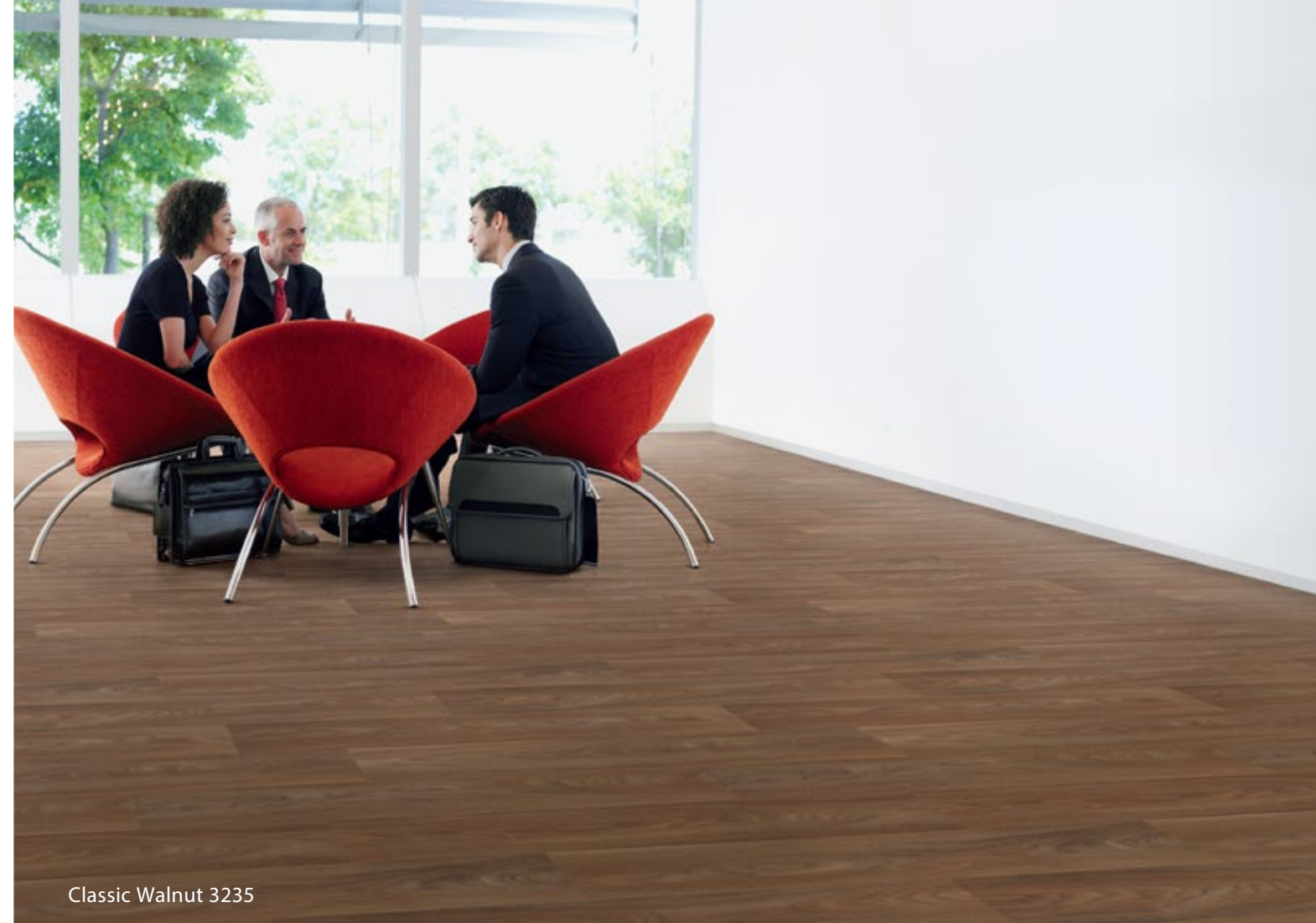
Classic Walnut 3235