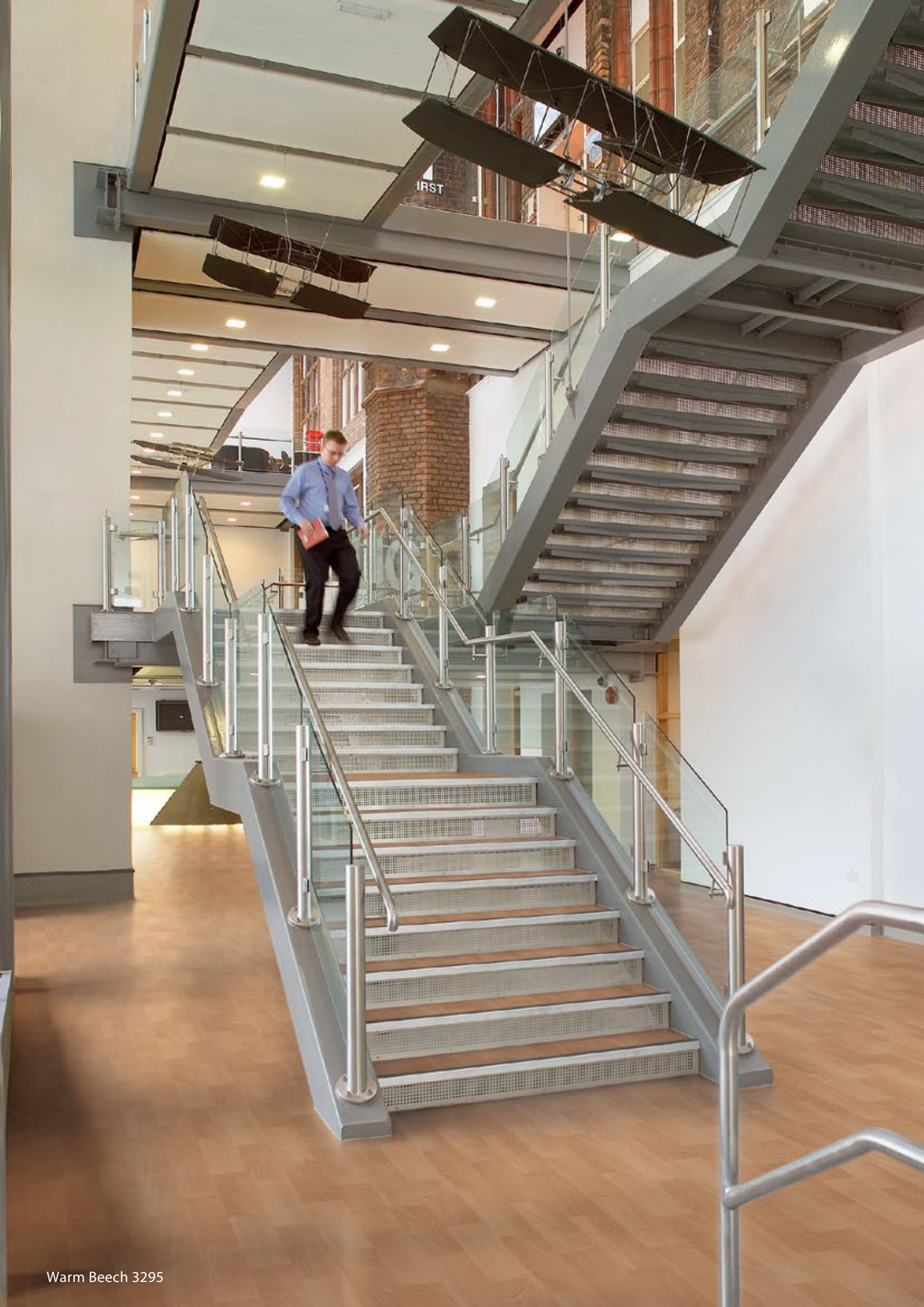
Warm Beech 3295