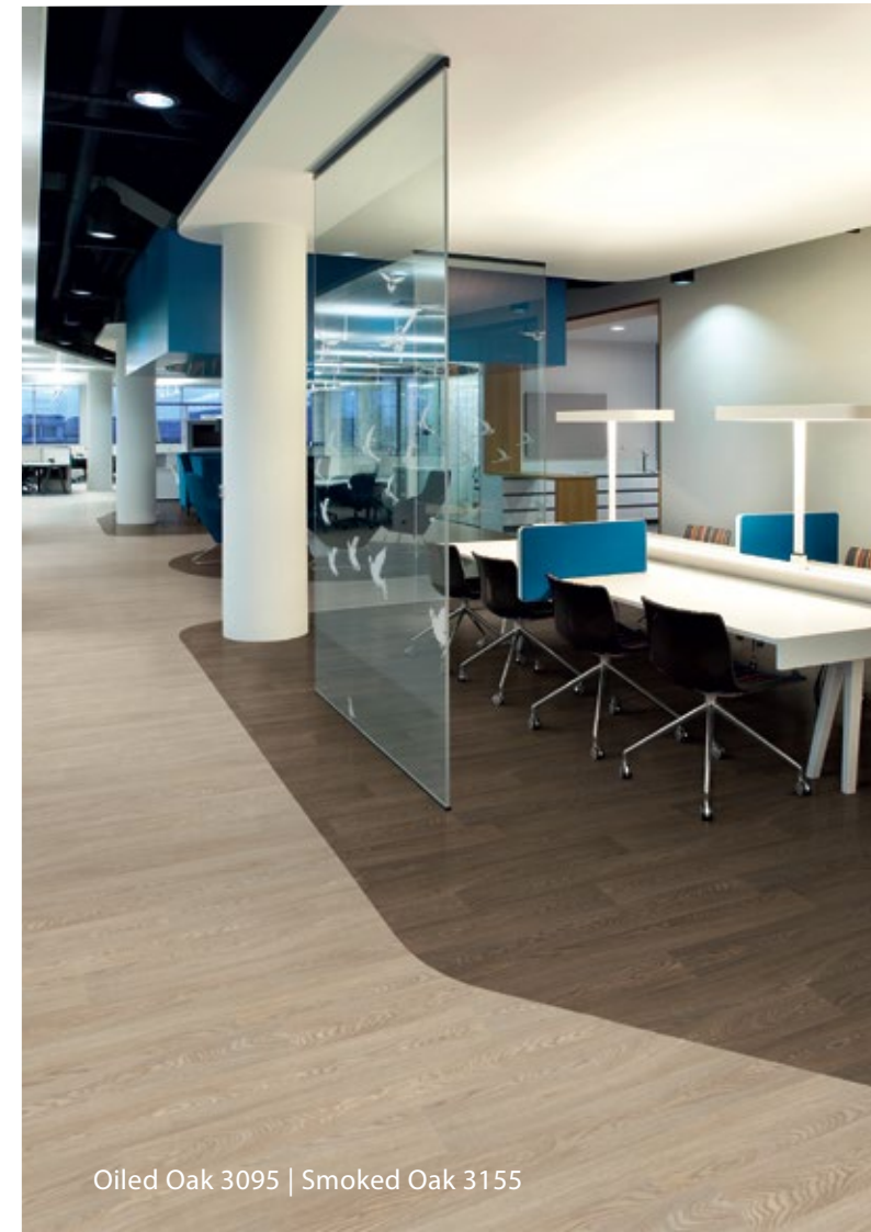
Oiled Oak 3095 | Smoked Oak 3155