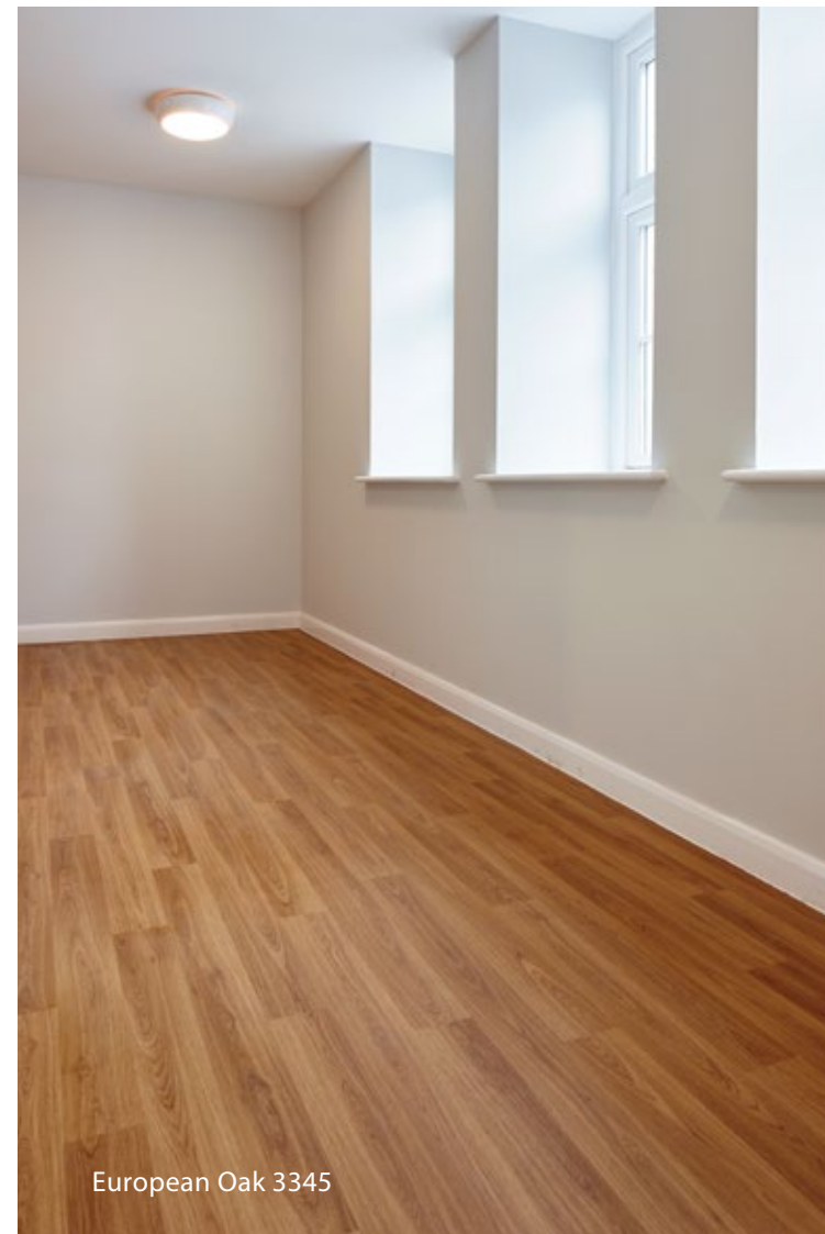
European Oak 3345