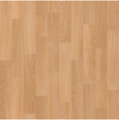
Warm Beech 3295 plank size in sheet: 100 x 500mm w/r 3290 LRV 34