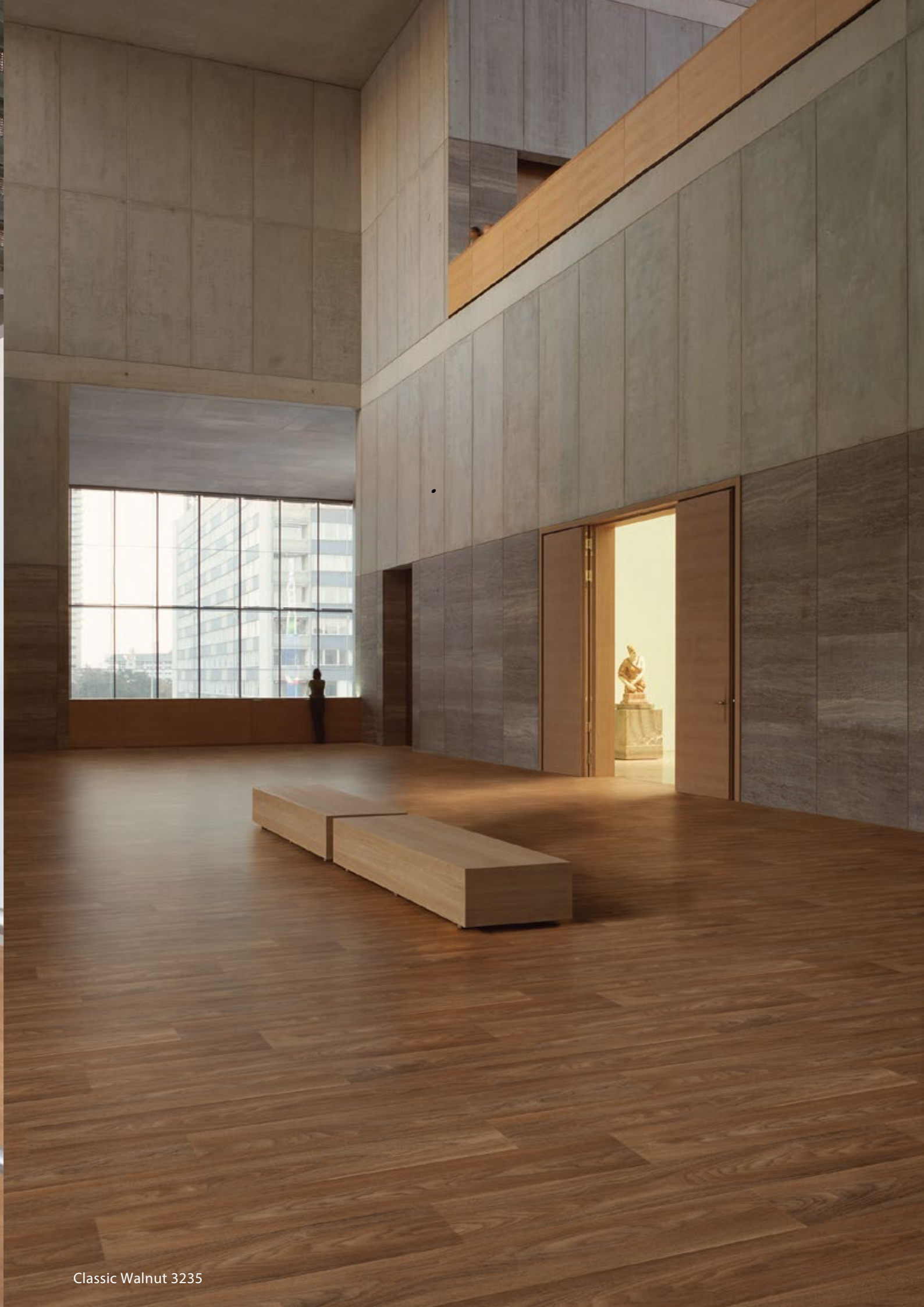
Classic Walnut 3235