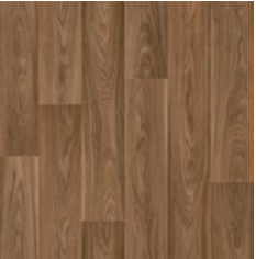
Classic Walnut 3235 plank size in sheet: 167 x 1000mm w/r 3230 LRV 13