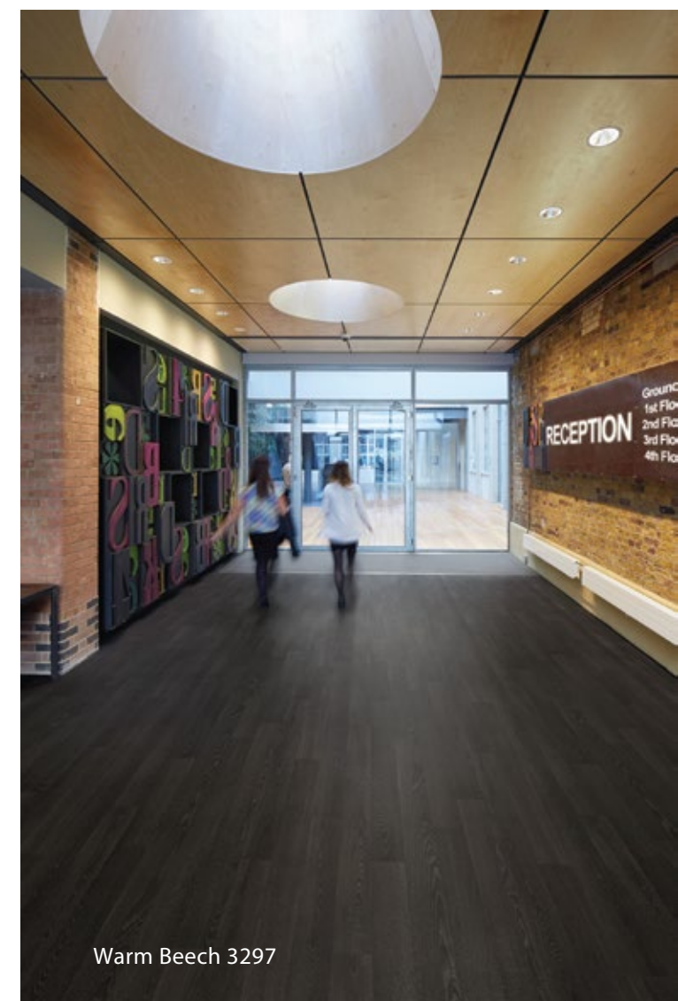
Warm Beech 3297