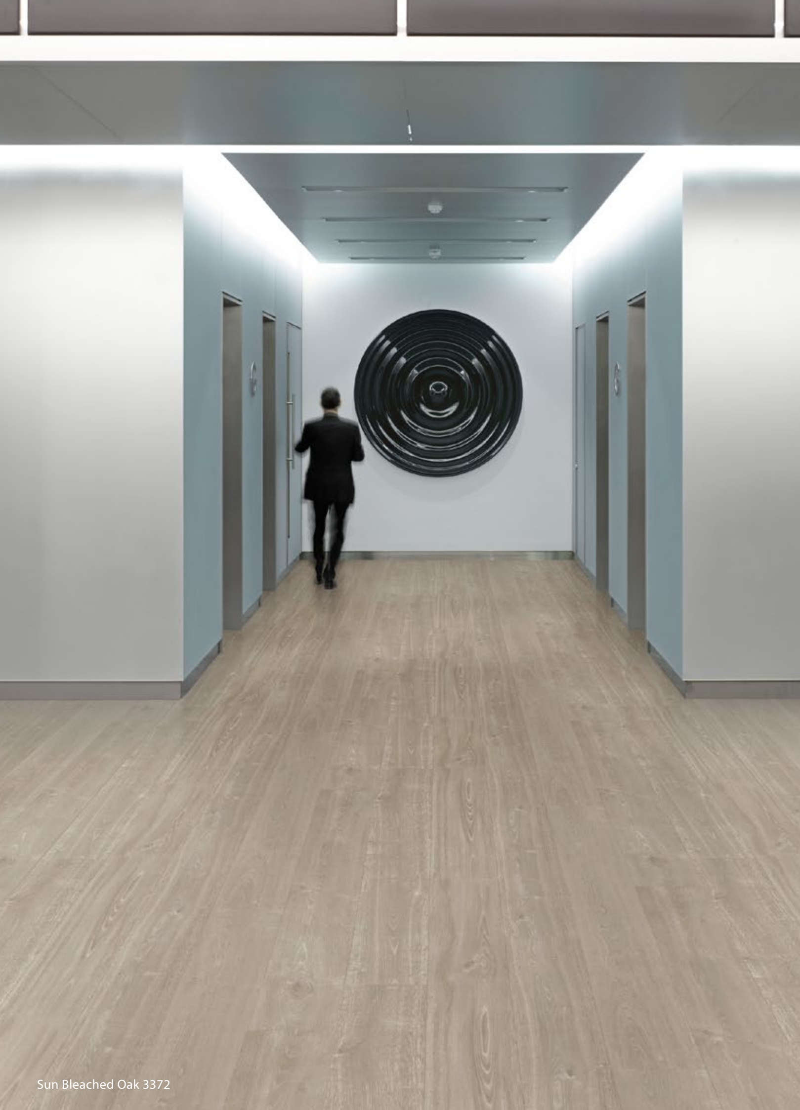
Sun Bleached Oak 3372