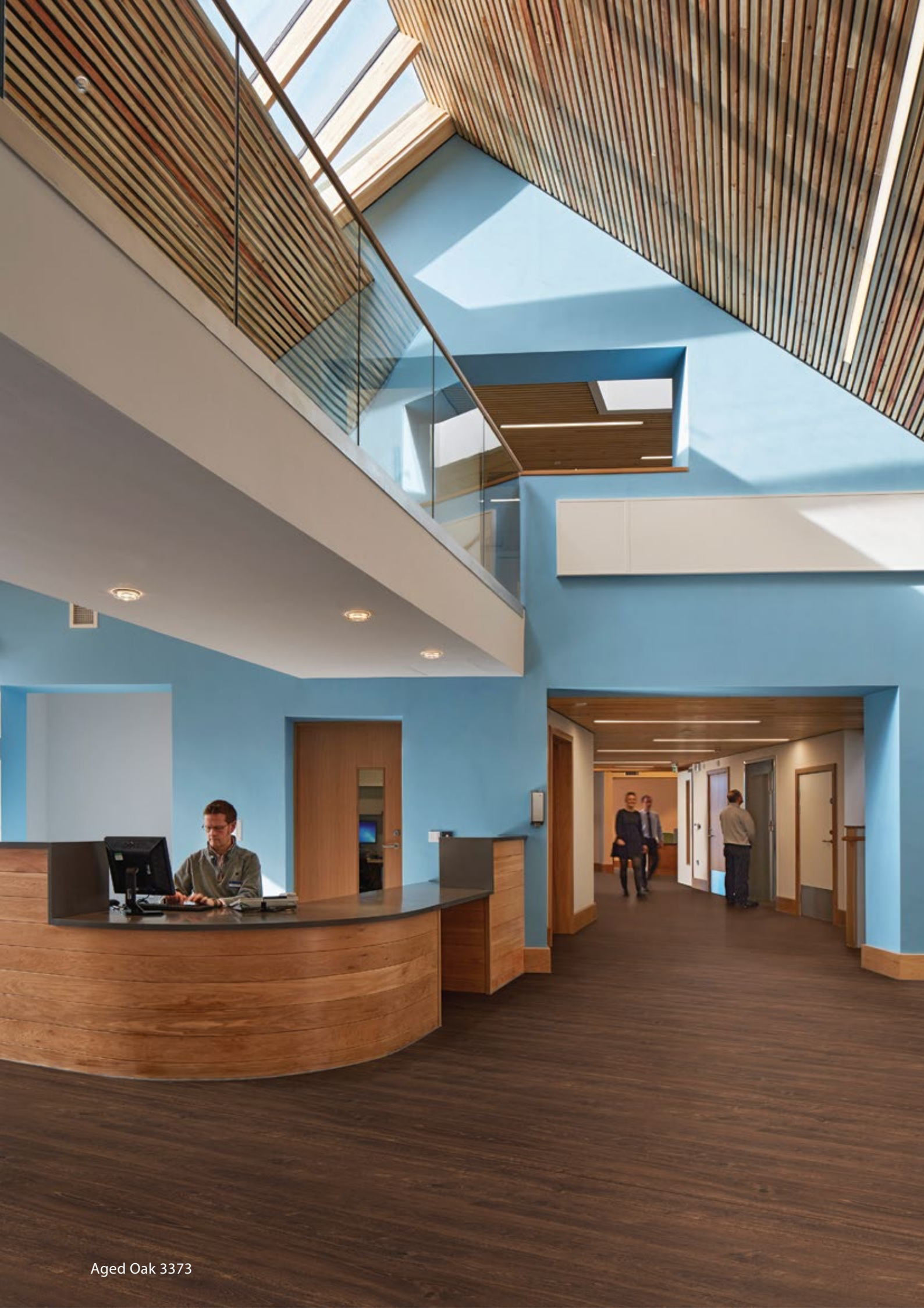
Aged Oak 3373