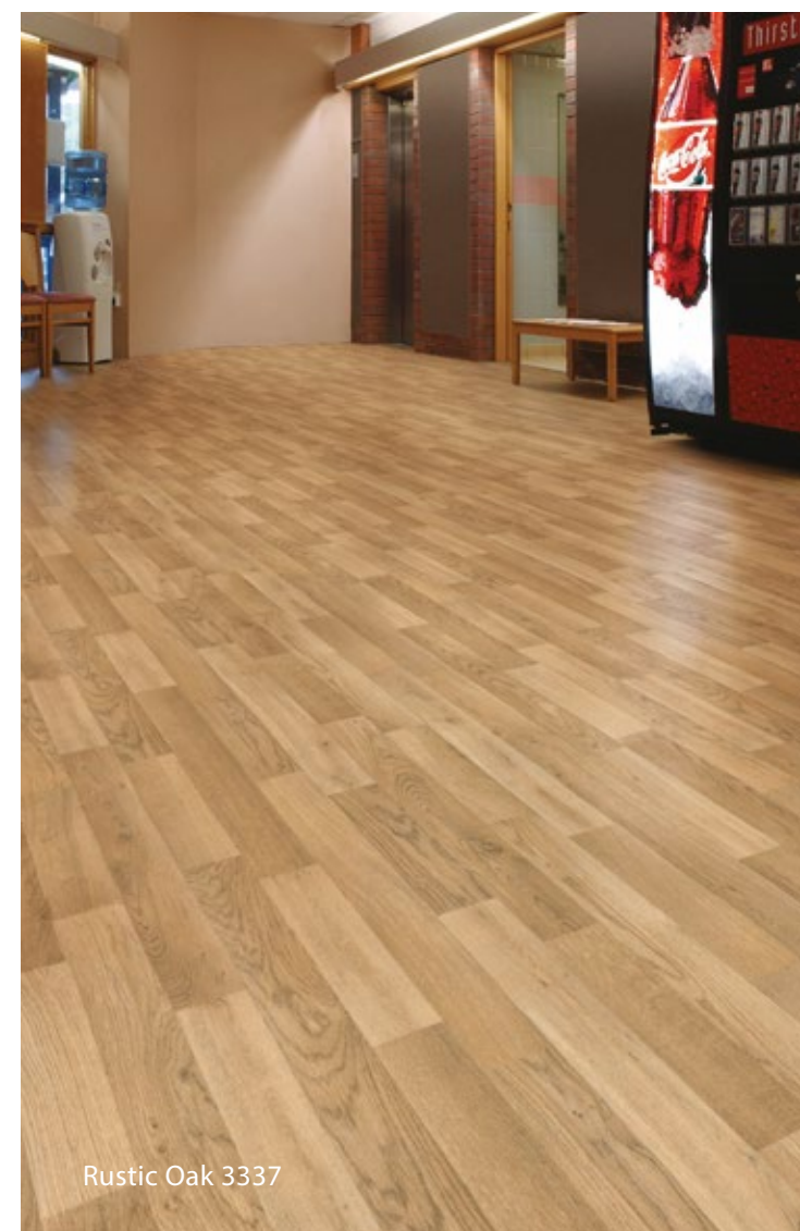
Rustic Oak 3337