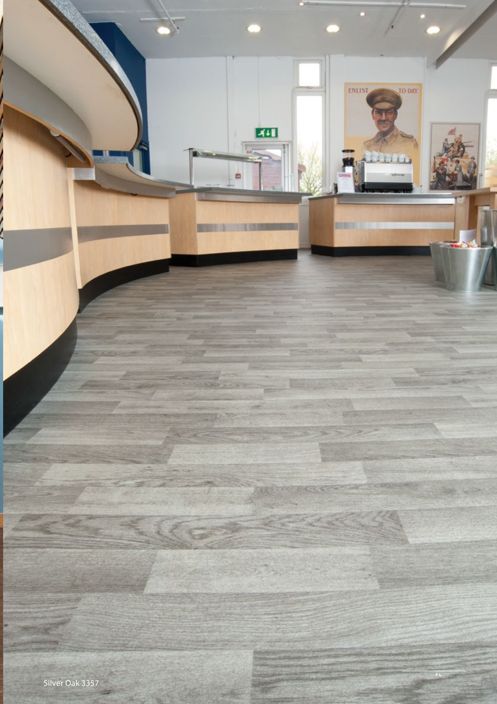
Silver Oak 3357