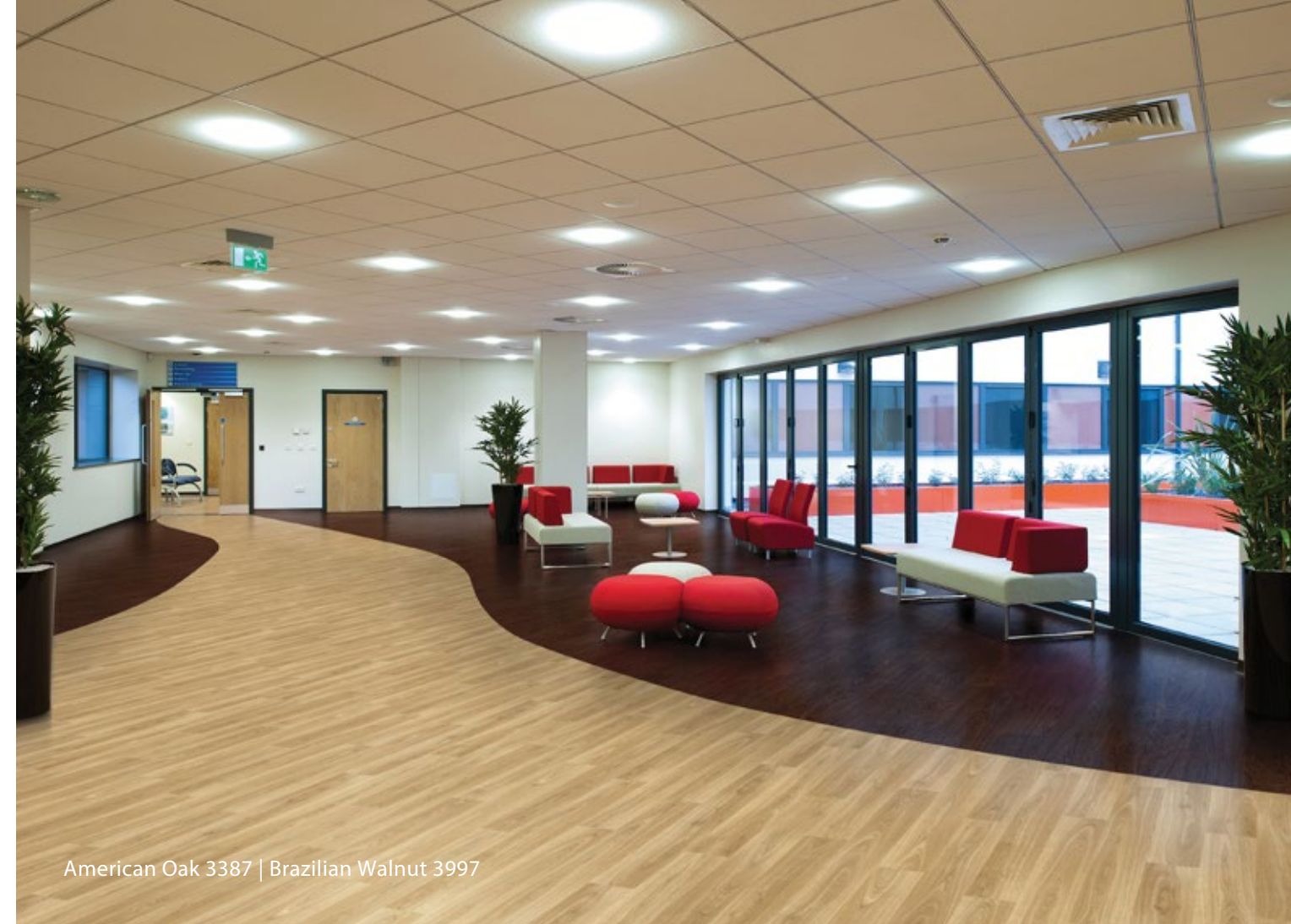
American Oak 3387 | Brazilian Walnut 3997