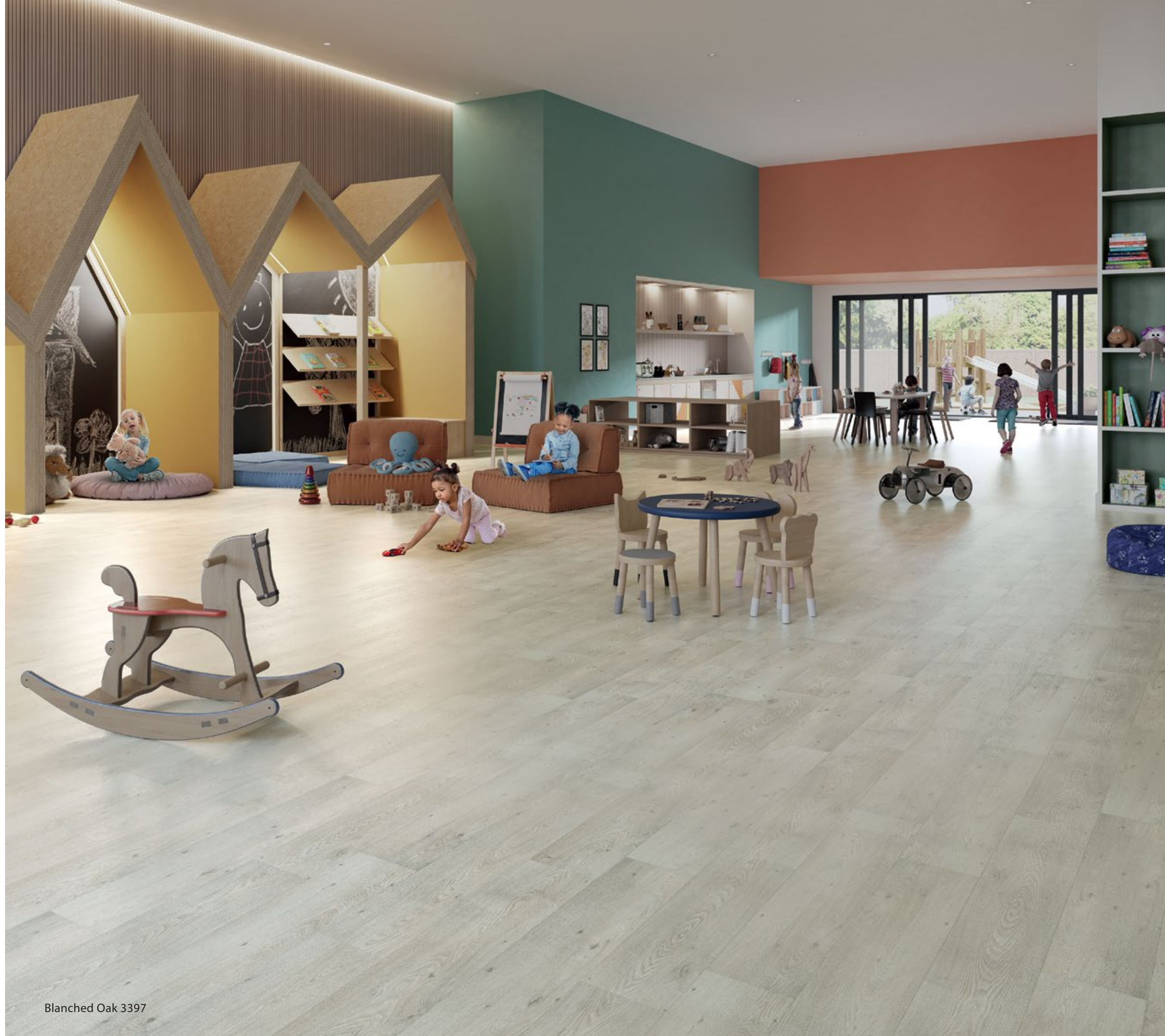
Blanched Oak 3397