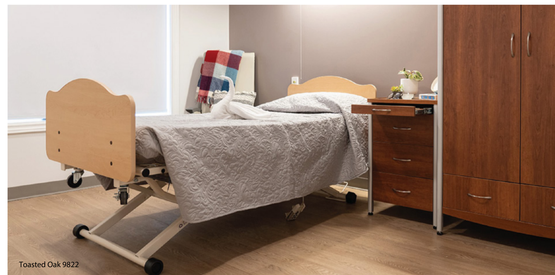
Toasted Oak 9822