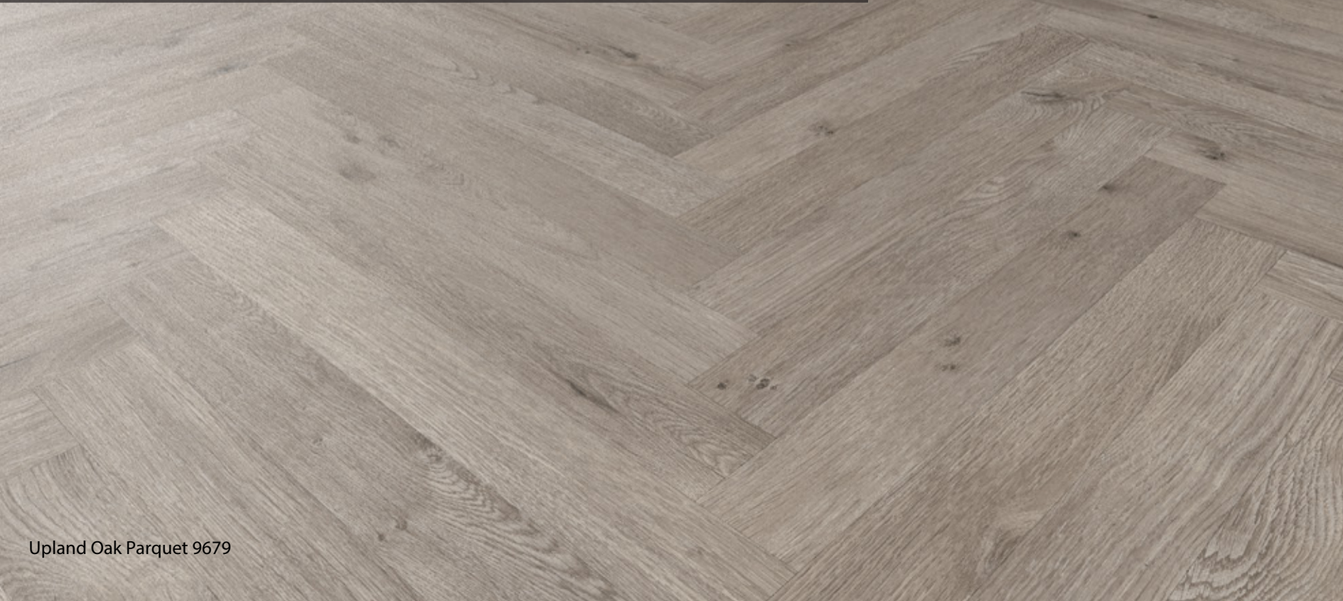
Upland Oak Parquet 9679