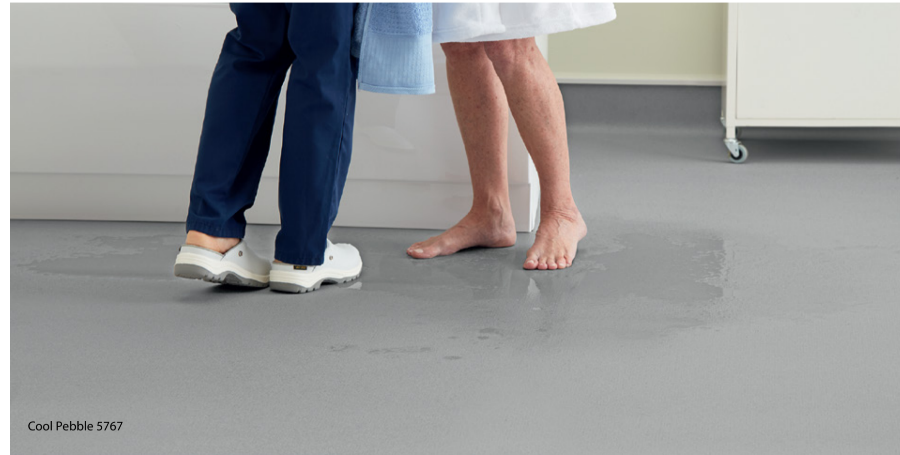
Cool Pebble 5767