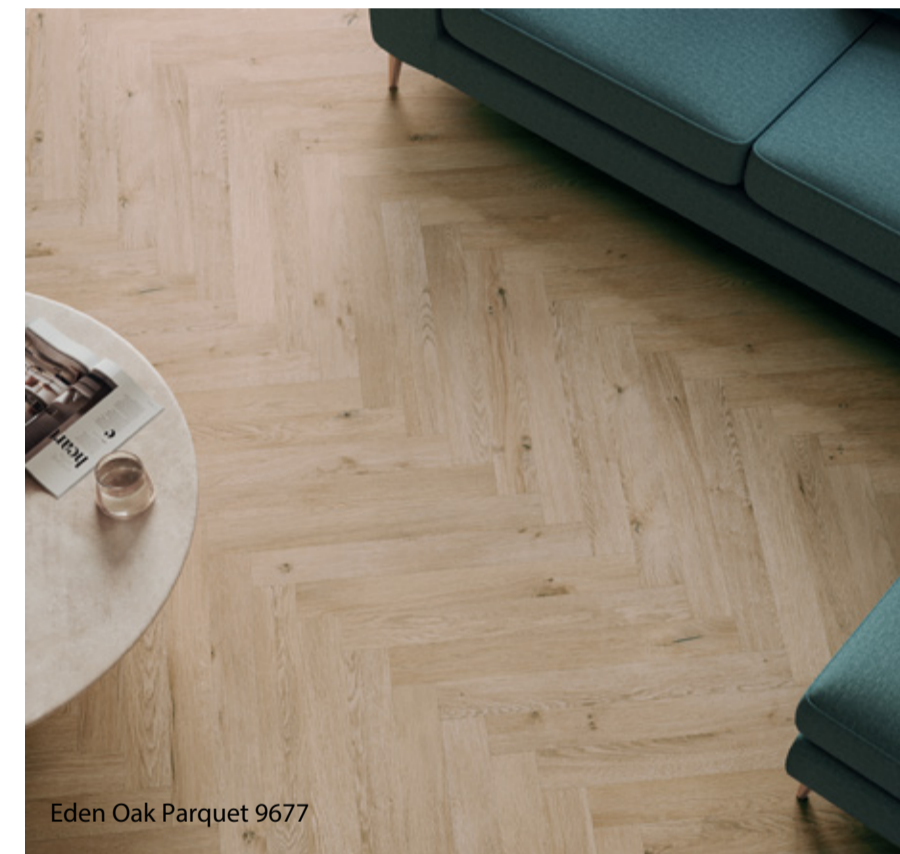
Eden Oak Parquet 9677